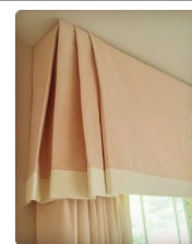
Drapery detail from our Greenville, SC nursery Saved from Instagram.com