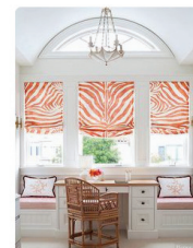
Ideas for Multiple Windows Putting even more attention on the grand architecture... Saved from architecture...