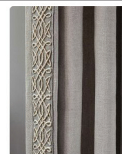
Samuel and Sons Passementerie