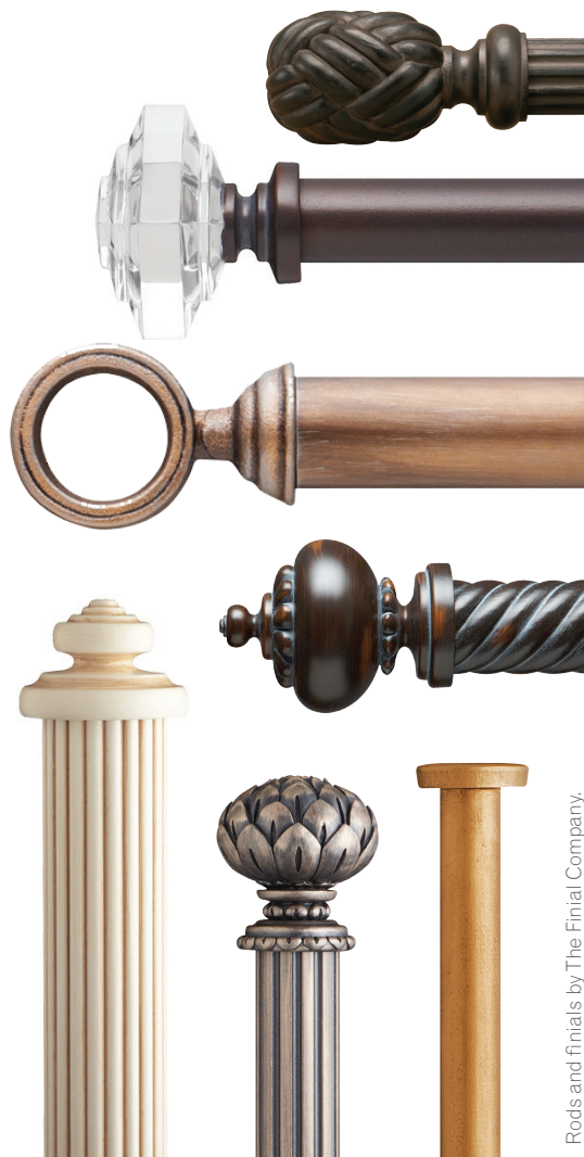
Rods and finials by The Finial Company.

For questions, contact the showroom by phone or windows@kdrshowrooms.com