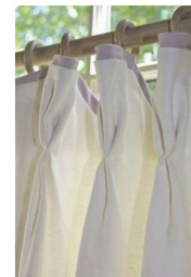
pinch pleat details